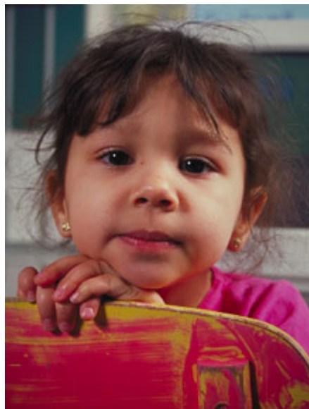
Ken Hammond, USDA