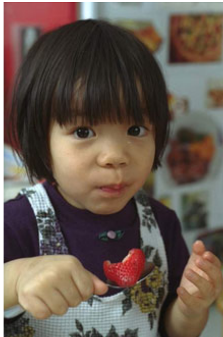
Ken Hammond, USDA